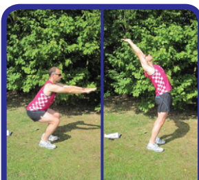
9 / Squat & Bow Stretch

Head and neck roll forward, arms hanging loosely, continue articulating through upper, mid and lower spine taking hands down shins towards floor and on floor if possible. Breathe in and return slowly straightening by moving pelvis forward, draw shoulders up to the ears and shoulder blades fall in soft v-shape.