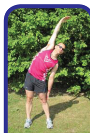
7 / Rainbow Stretch

Hold arms out at shoulder height as if carrying a tray of drinks. Whilst keeping hips facing front on, rotate through the spine, with eyes following elbow to left rotation right through opposite direction, in a controlled motion.