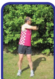
6 / Spine Rotation

Flex the spine sideways by gently running hand down towards knee whilst the other hand draws up toward the arm pit. Remain upright without leaning forward or backwards.